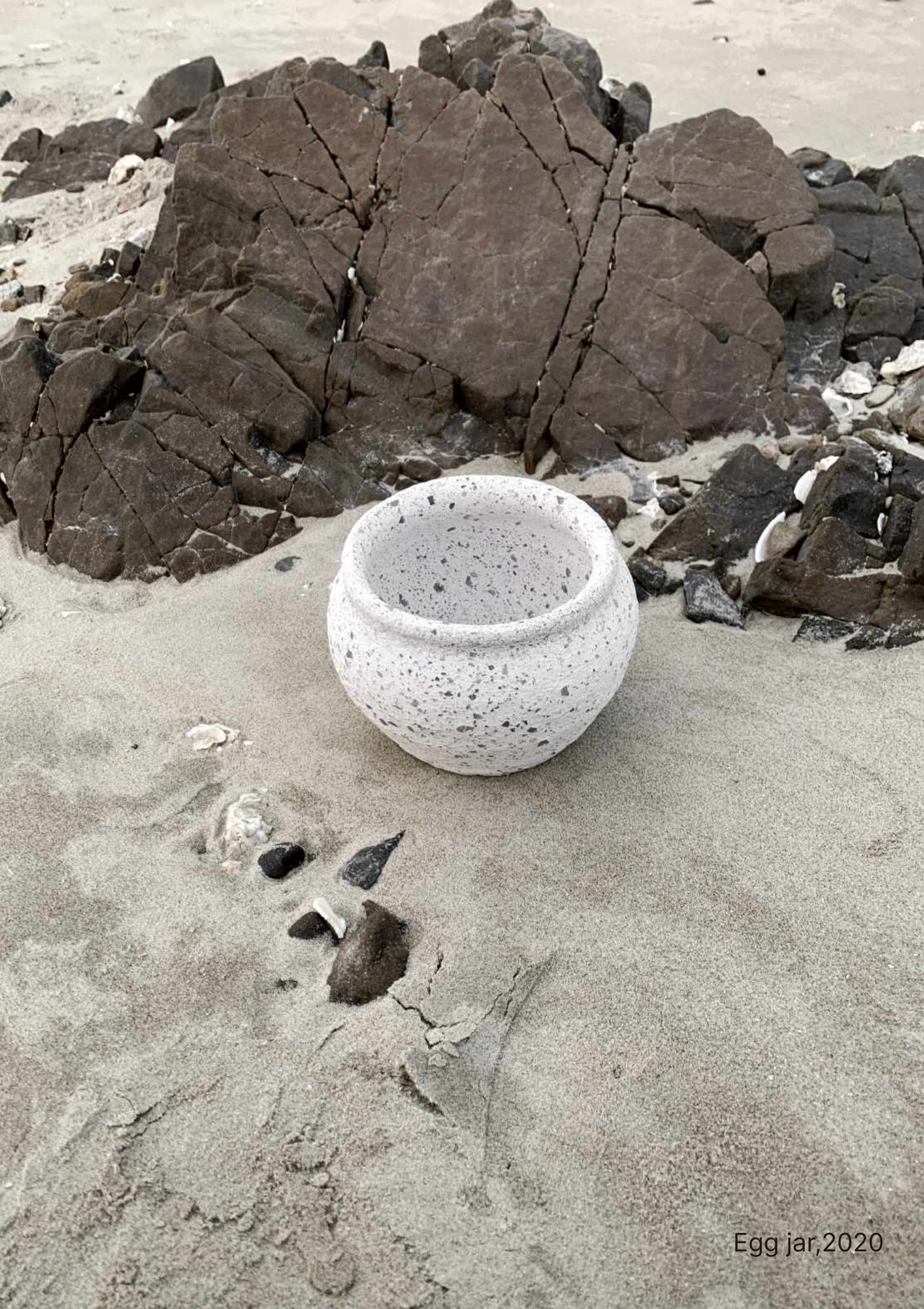
Egg jar, 2020