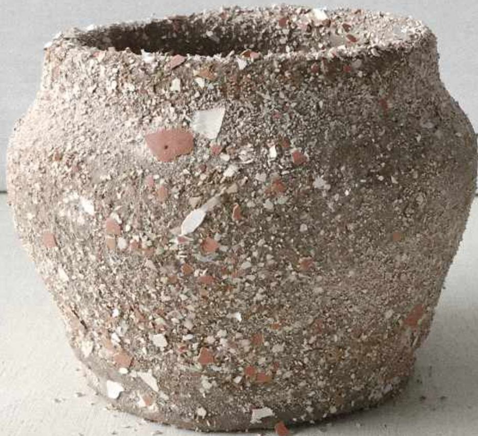
Egg jar, 2020