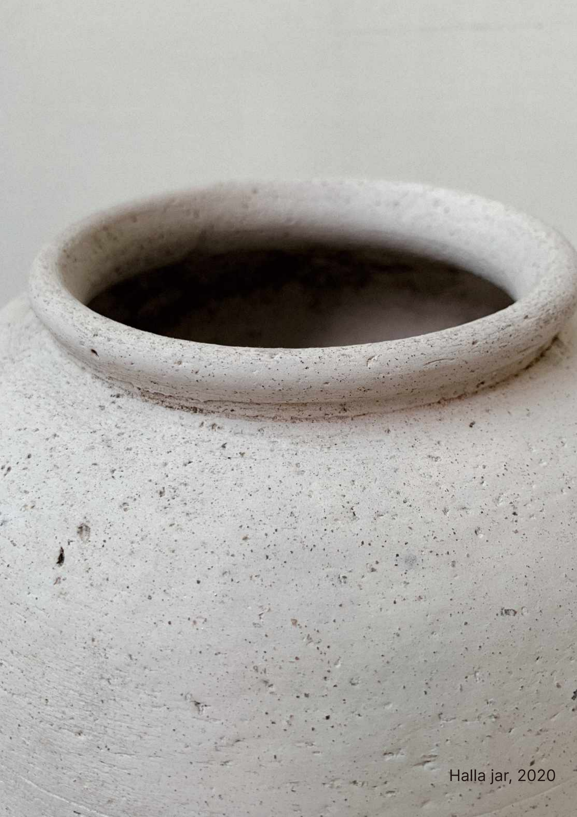
Halla jar, 2020